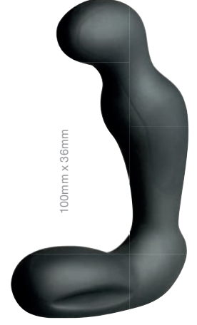
EM3104 - SIRIUS

Part jiggle ball, part muscle toner; Lula features a free-roaming weight that massages her G-spot and bi-polar conductive contacts to help her indulge in delicious internal sensations..