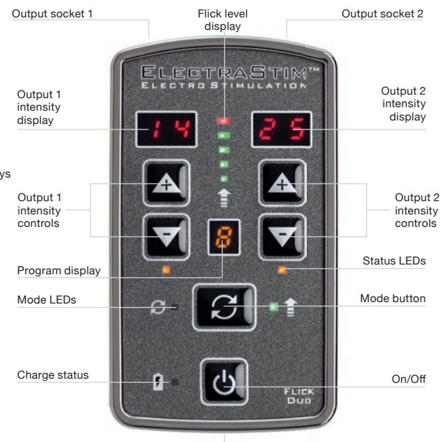
USB charge socket